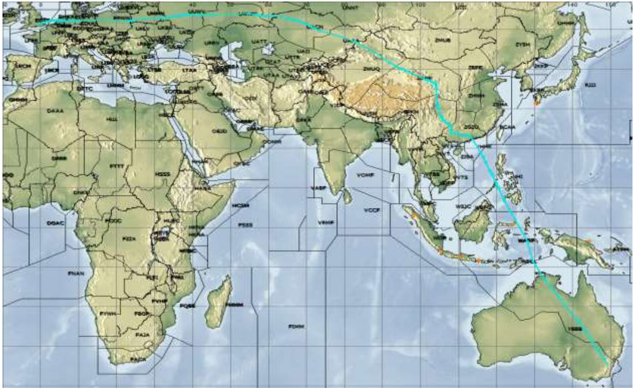
London – Sydney Route